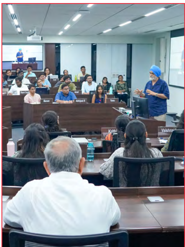
Dr. Montek Singh Ahluwalia , Former Deputy Chairman of the Planning Commission of India in a guest lecture on “India’s Economic Development: Critical Challenges Ahead”

Dean, Kautilya School of Public Policy; Former Permanent Representative of India to the UN