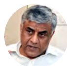
Dr. M. V. Rajeev Gowda

Former International Civil Servant with International Monetary Fund