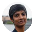
Dr. Menaka Guruswamy

Former Member of Parliament; Chairman, Congress Research Department